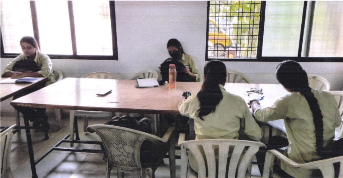
Arrangement in the reading room on the ground floor for the differently-abled students along with the general students.