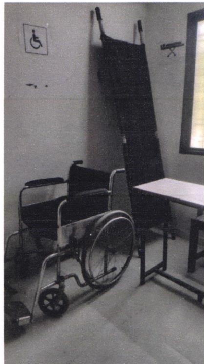
Wheel Chair and Stretcher for differently-abled students.