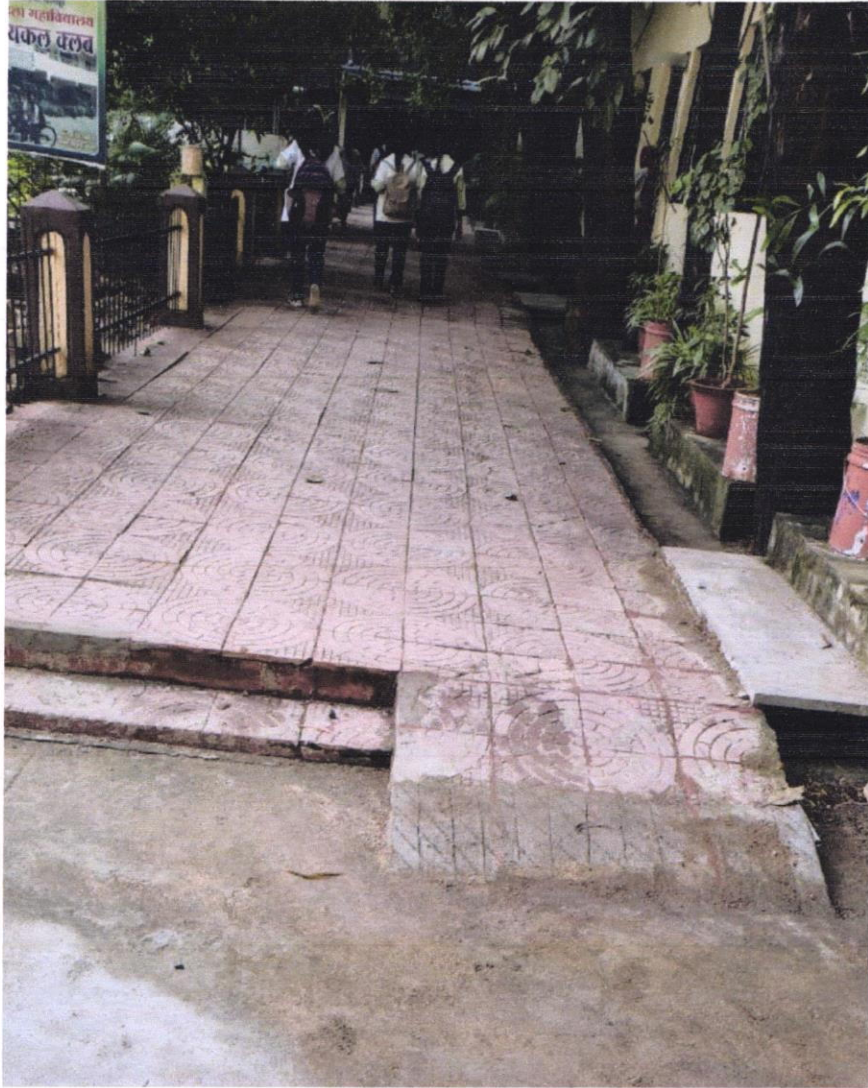
Differently-abled friendly sloping path leading to college reading room and examination room..