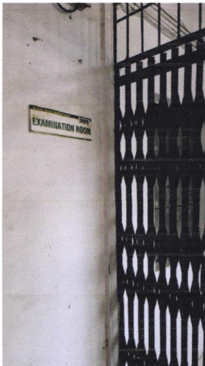
Examination room on the ground floor for the differently-abled examinees.

Provision of wheel chair and stretcher is made for to and fro movement within the campus. To make it more convenient for them an examination room is set up on the ground floor so that they could cozy to concentrate on the examination.