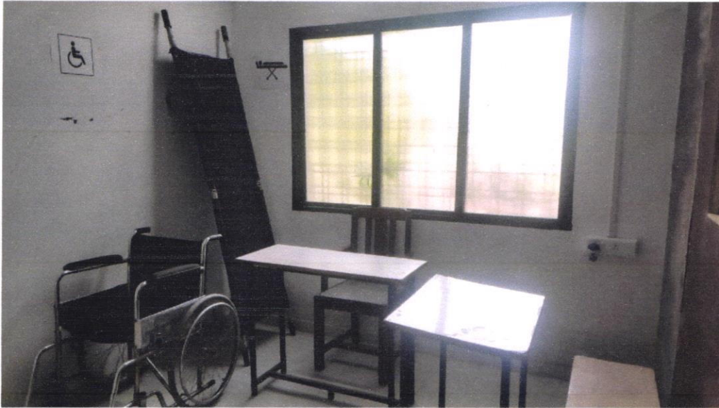
Arrangement in the examination room for the differently-abled examinees.